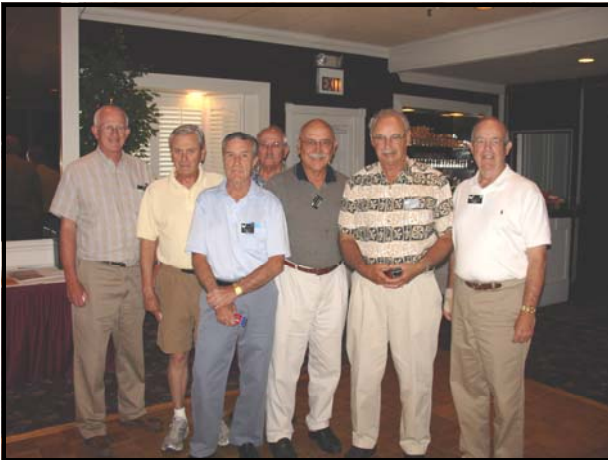
M A Y P O M G O L F