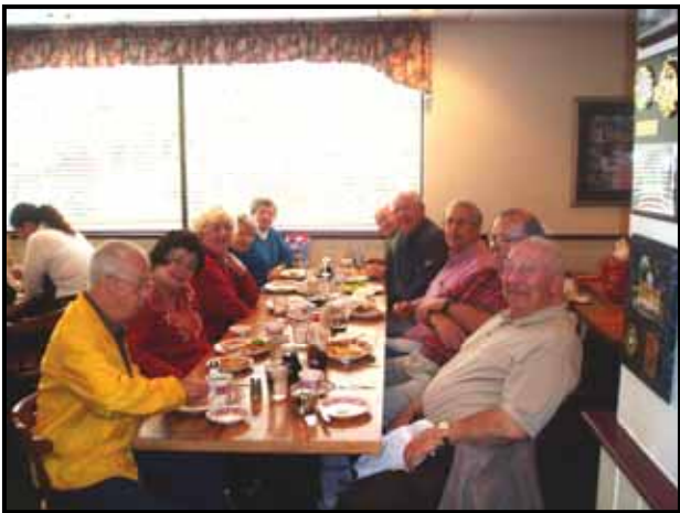
Some of the Branch 125 members took the wives out to a Holiday lunch in December.