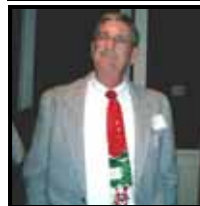
Golfer with nice tie!!