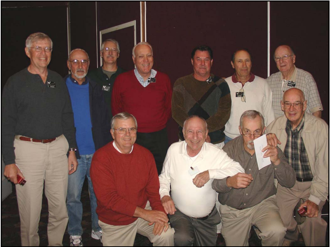
These are the winners of the Golf Players of the Month (POM) awards for November and December