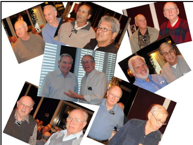
A collage by photographer Jerry Oliver