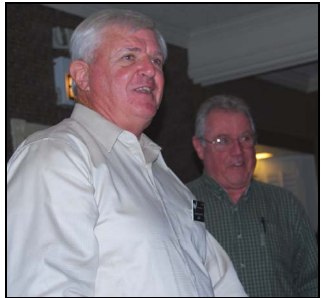
Guest of the Month