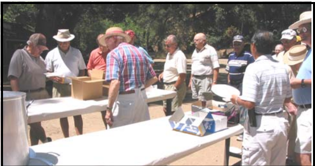
LINING UP FOR THE BBQ