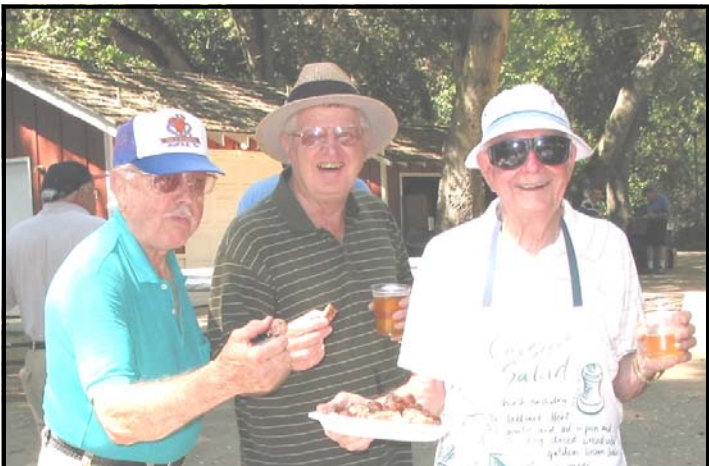
THE TASTING COMMITTEE