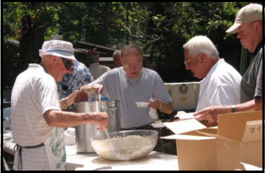
The SERVING LINE