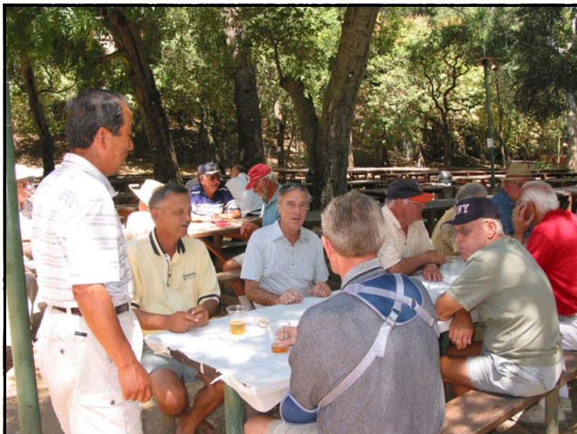
THE DECISION MAKERS