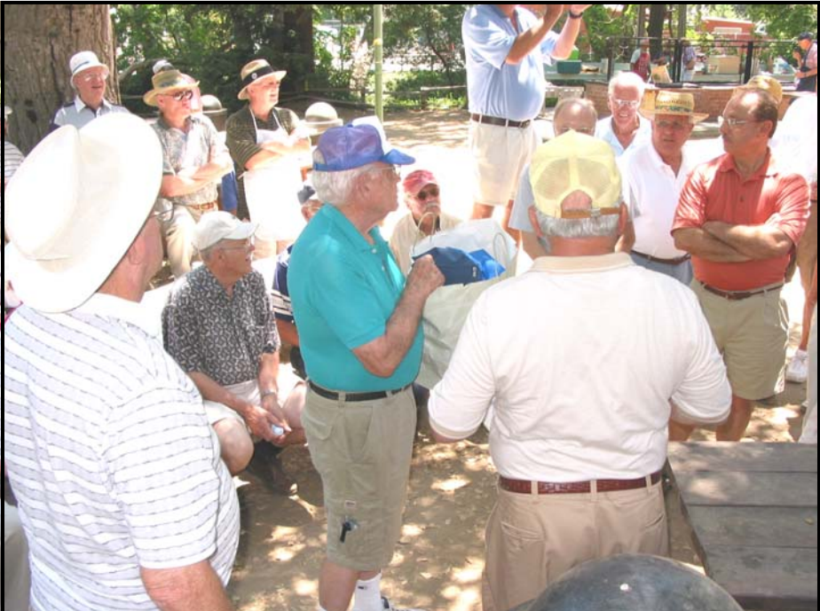
The GOLF REPORT