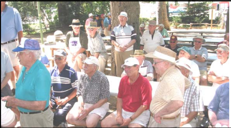
WAITING FOR LUNCH