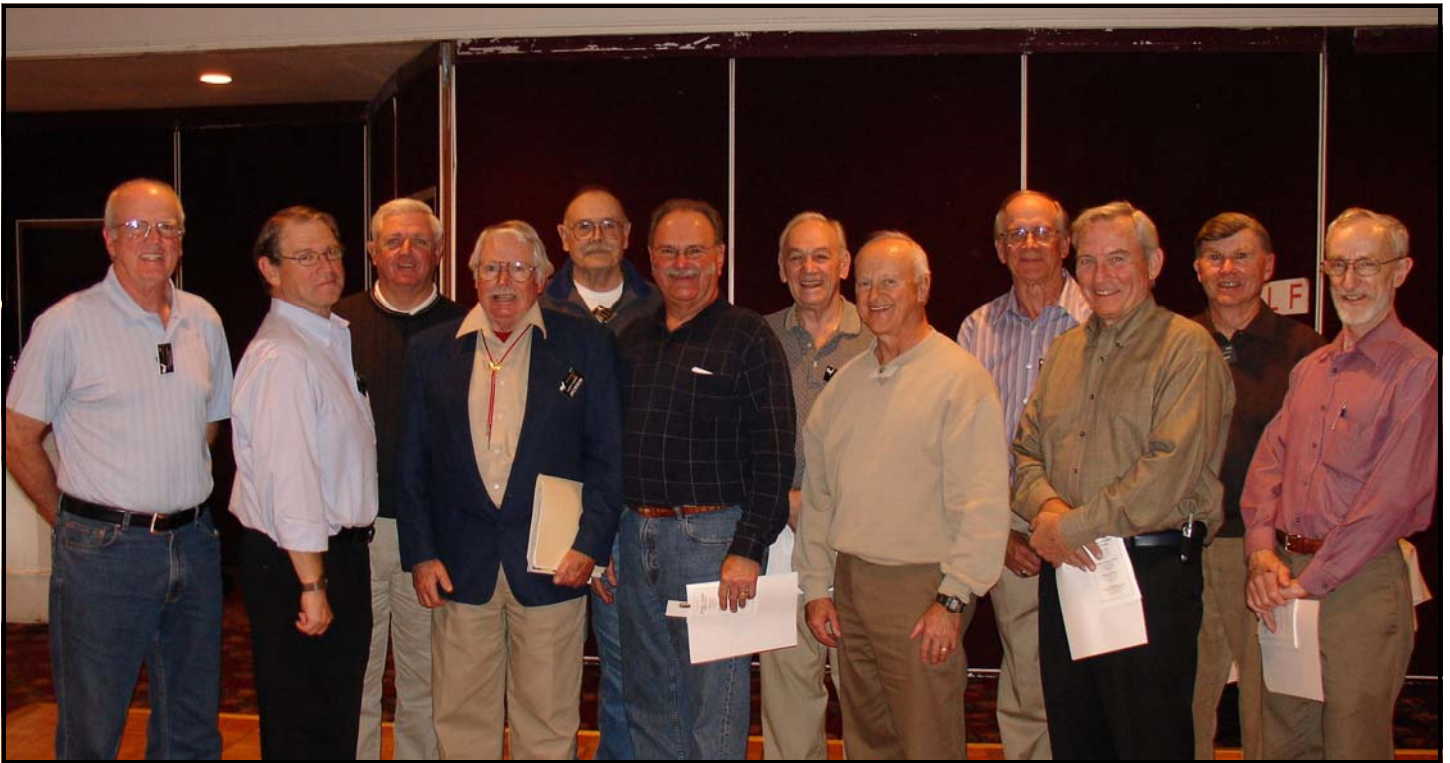
Six new members were inducted in March. Please welcome them!!